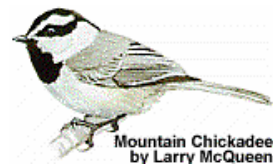
Mountain Chickadee by Larry McQueen

The mountain chickadee is a small bird that lives year-round in the Eastern Sierra. Smaller than sparrows, mountain chickadees have a black head and neck, gray back and tail, and a lighter colored underside. They are very active, curious, and quick moving birds that are heard more often than seen with their distinctive "chick-a-dee" call. They are also referred to as the "cheeseburger bird" due to their spring/summer call that sounds similar to "cheese-bur-ger." Living in forested areas, they can be seen alone or in loose flocks eating insects, fruit, and seeds. They are relatively tame and are sometimes seen hanging upside down from tree branches foraging for food. Both parents raise their clutch of six to eight eggs in a nest that is four to 10 feet off the ground in a tree cavity or nest box.